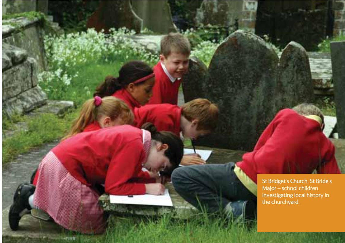
St Bridget's Church, St Bride's Major – school children investigating local history in the churchyard.

Community Councils and Local Authorities do offer grant assistance in some places but more help is needed if our churchyards are to continue to serve Welsh communities.