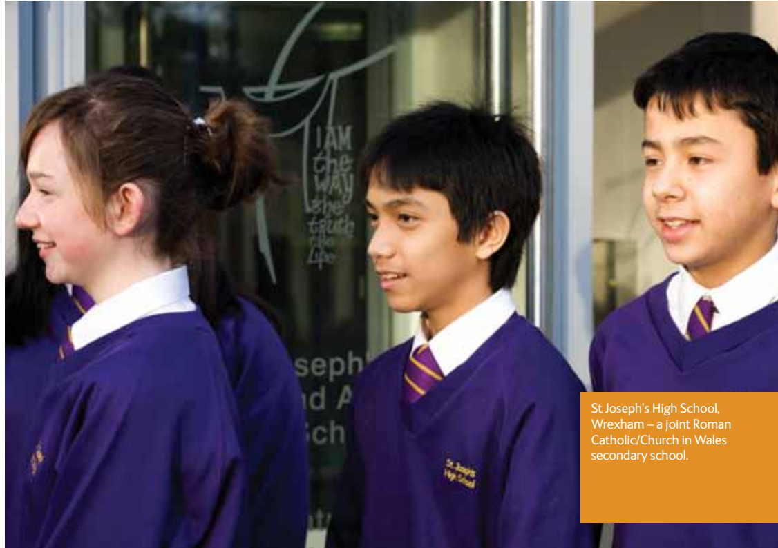
St Joseph's High School, Wrexham – a joint Roman Catholic/Church in Wales secondary school.

Our schools are committed to helping all children to reach their full potential and to do so in an atmosphere of acceptance and reflection that gives direction and purpose to their lives. In today's world, attitudes and spirituality, values and aspirations will be as important as technical competencies.