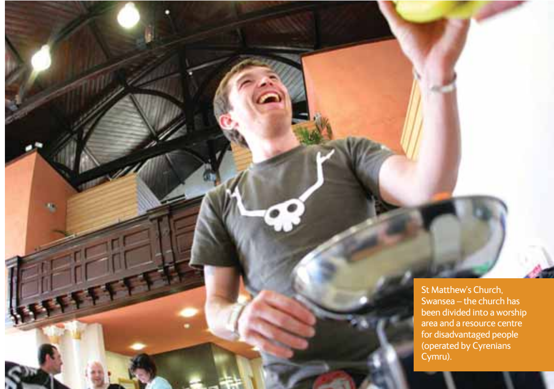
St Matthew's Church, Swansea – the church has been divided into a worship area and a resource centre for disadvantaged people (operated by Cyrenians Cymru).

The church is increasingly the last public building left in a community and it plays a key role in helping to inspire and transform communities and congregations.