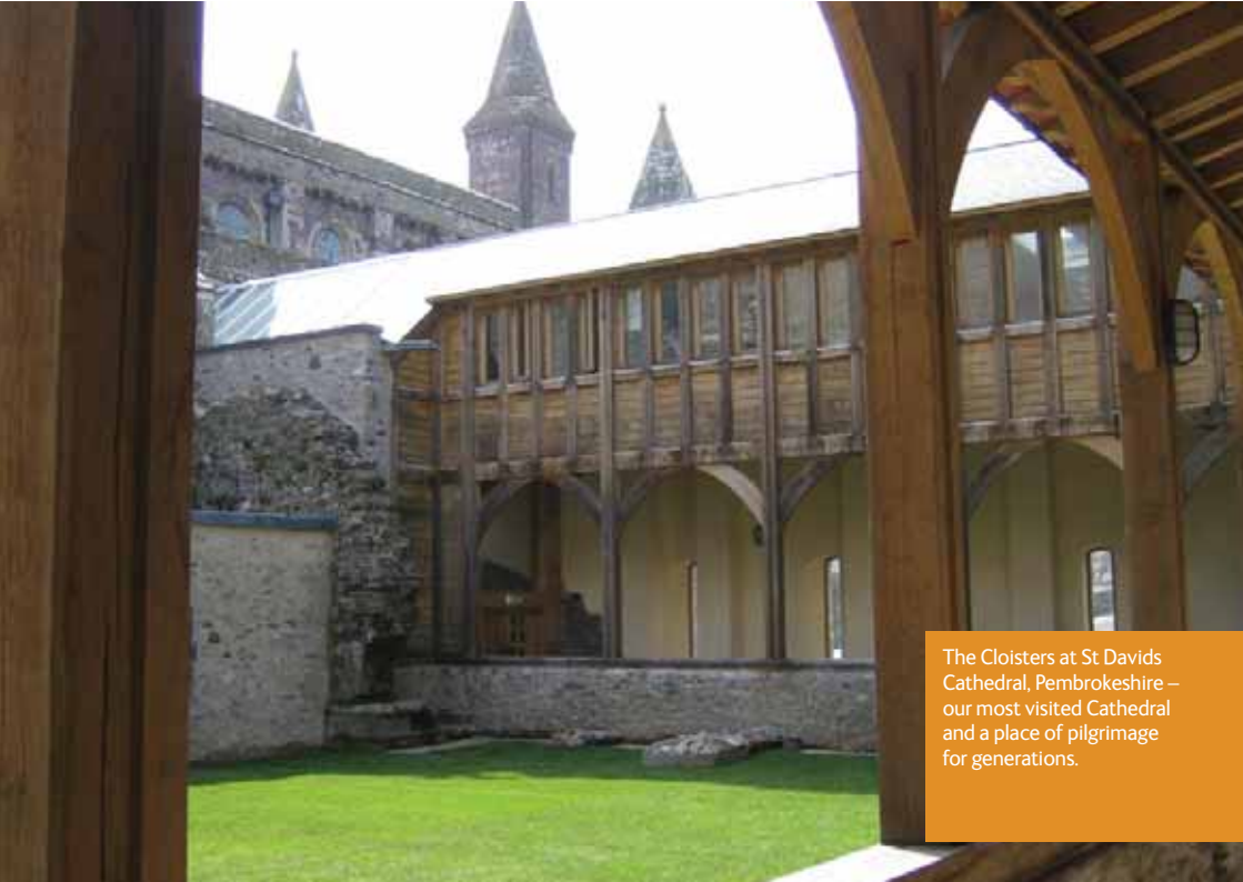
The Cloisters at St Davids Cathedral, Pembrokeshire – our most visited Cathedral and a place of pilgrimage for generations.

There is a continuing challenge to fund these vital community assets.