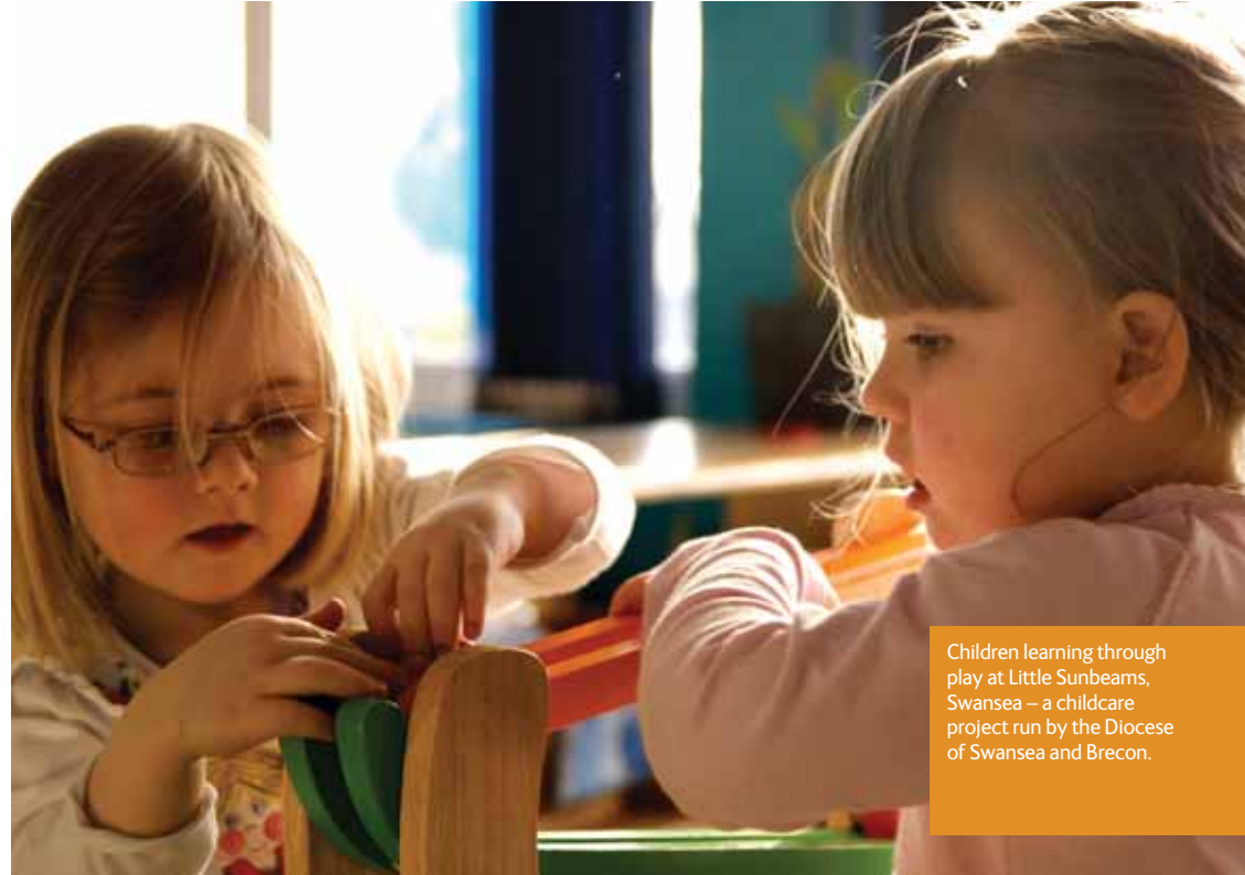
Children learning through play at Little Sunbeams, Swansea – a childcare project run by the Diocese of Swansea and Brecon.